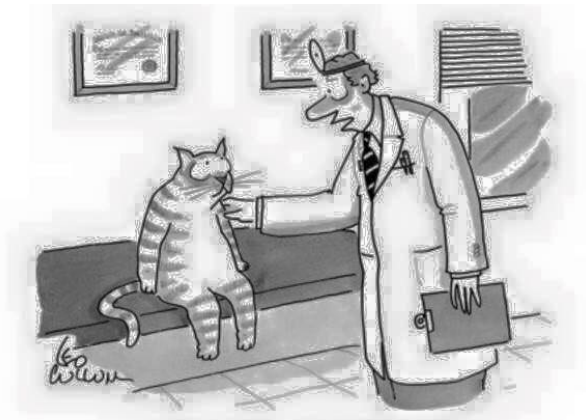
"Bad news, its curiosity"